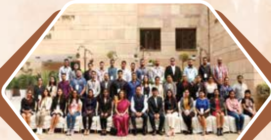
Group photo of 62 nd KIP

a flagship initiative for Diaspora engagement which familiarizes Indian-origin youth (18-30 years) with their Indian roots and contemporary India through a 25-day orientation programme organized by OIA - II Division. The familiarization programme at SSIFS included modules on India and India's foreign policy.