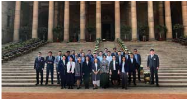
Visit to Rashtrapati Bhavan