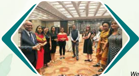
Welcome dinner hosted by Dean (SSIFS)