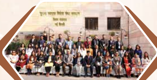
Group photo of 63 rd KIP